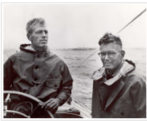
Olin & Rod Sailing Constellation 1964